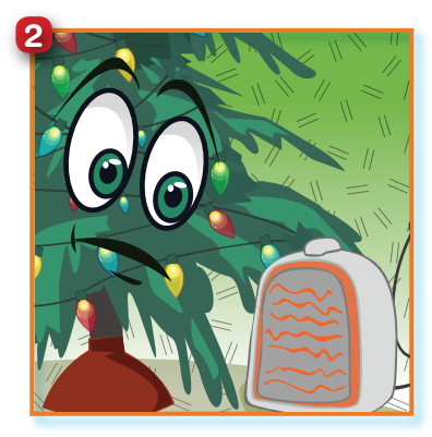
Keep the space h____t__r far away from the tree and other decorations.