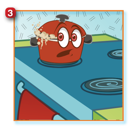
Make sure an adult pays attention to food that is c____ ok___ ___g.