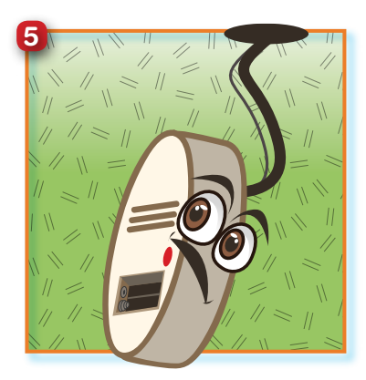
Have an adult test sm__ke a___rms every month.

Ask your teacher for Student Activity Sheet 3!