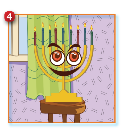
Never leave lit c____d___unattended.